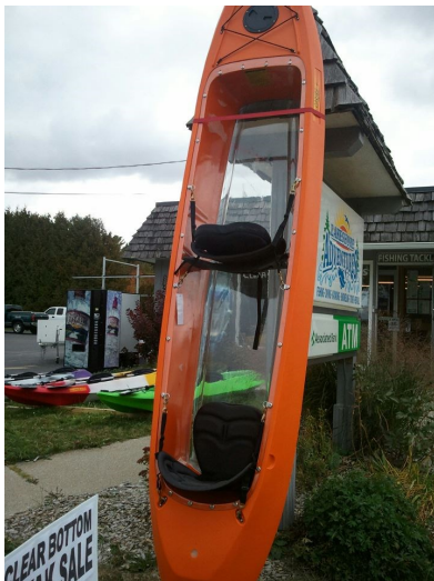
Clear Bottom Kayaks